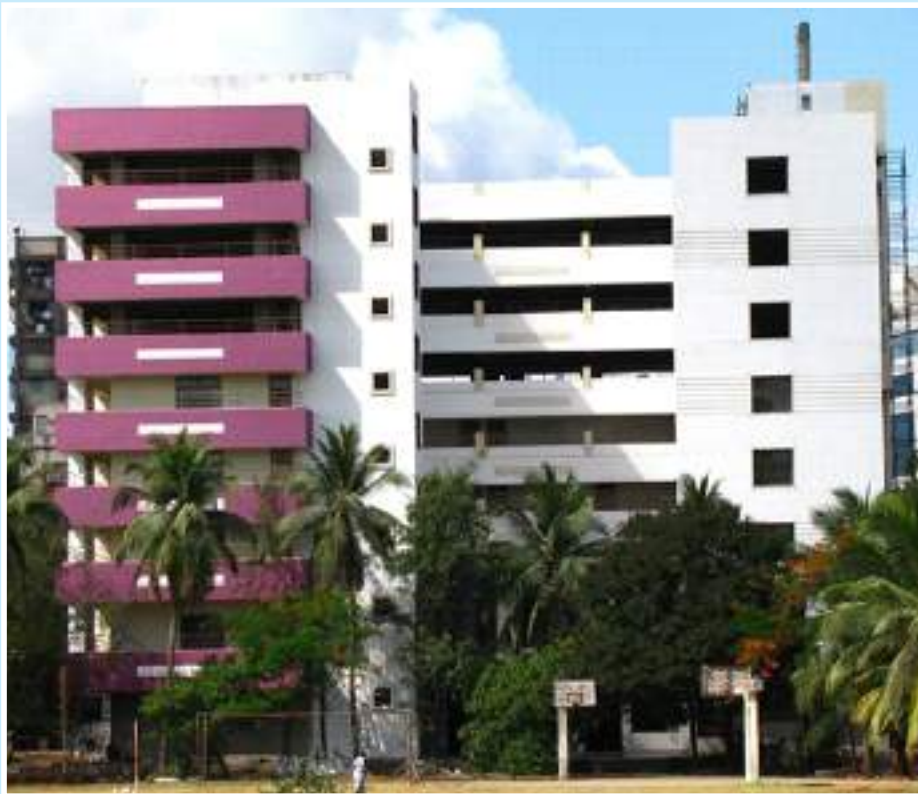
'Law College Building' in MES Mumbai Campus

Tel. No.: +91 022 2430 4417 / + 91 88 799 717 32